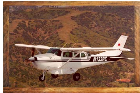
Private Plane Ride over Country Side