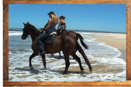
Beach Horseback Rides - Jeffrey's Bay