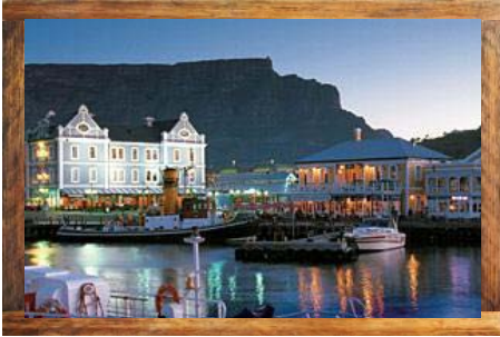
The Victoria and Alfred Waterfront