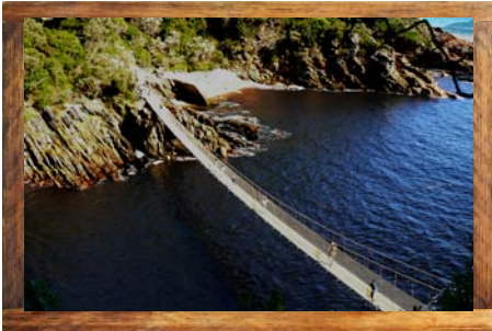
Hiking at Storms River