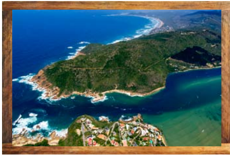
Featherbed Eco-Park - "The Heads", Knysna