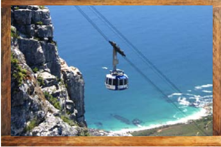
Top of Table Mountain