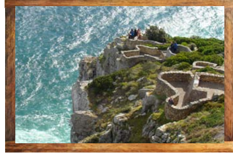
Visit to Cape Point