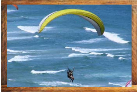
Paragliding at "Map of Africa" - Wilderness