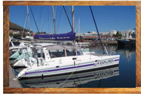
Catamaran Sundowner Cruise - Knysna Lagoon