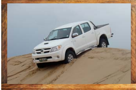
4 by 4 Rides on the Dunes of Oster Bay