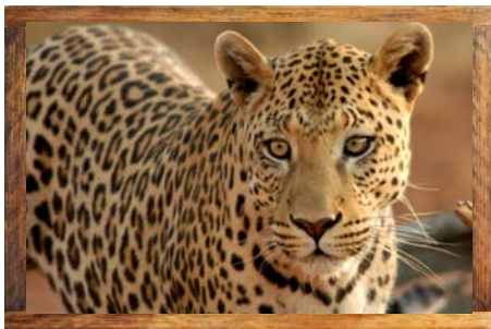
Game Drives & Walking Safaris - Kruger Area