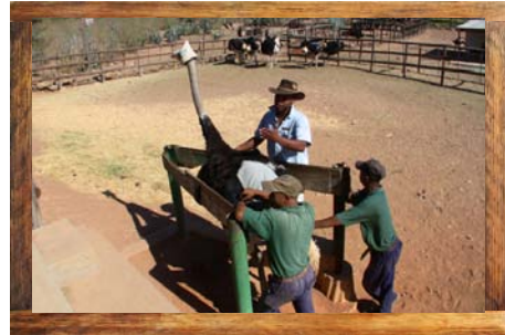
Ostrich Farm Tour and Rides