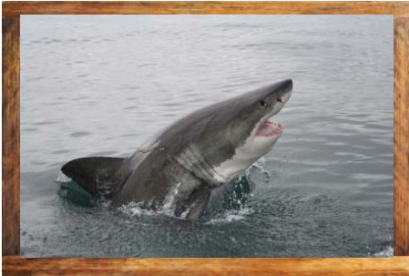
White Shark Viewing/Diving