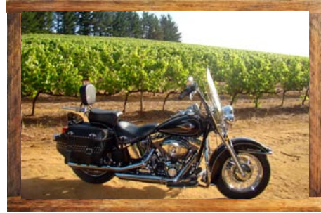
Harley Davidson Tour of the Wine Region