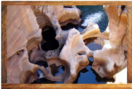
Blyde River Canyon - Panorama Route