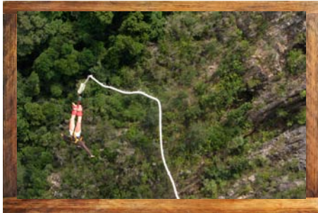
World's Highest Bungy - Bloukrans Bridge