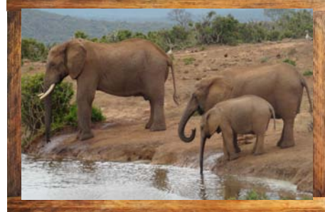
Safari at Addo Elephant Park