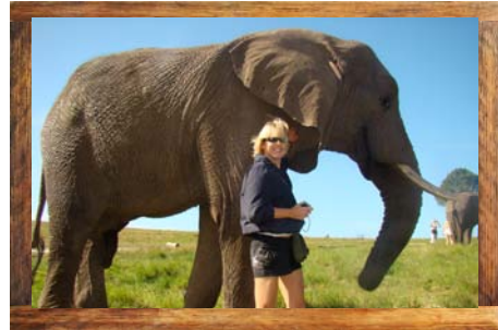
Elephant Sanctuary - Plettenberg Bay